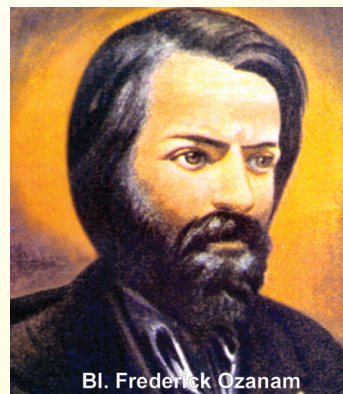
Bl. Frederick Ozanam

The duty and right of the laymen for mission work originates from the same union with Christ that arises from baptism. They are called to bear witness to Christ in the world around and to offer spiritual sacrifices through all their activities. Only through the meditation of the word of God in the light of faith can one see God everywhere and at all times and to bear witness to Him (Lay Apostolate AA 3,4). They are obliged to sanctify the milieu they move in, events and experiences by the spirit of the Gospel. Saints like St. Monica, Bl. Frederick Ozanam, St. Elizabeth of Hungary, Mumma Margret, the mother of St. Don Bosco, St. Geanna Beretta Jhanna Molla who gave up her life to save the child in the womb etc. teach us how lay people can become saints through lay missionary activities.